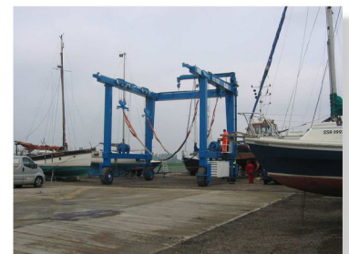
Travel hoist in the boatyard

Beckett Rankine 270 Vauxhall Bridge Road Westminster London SW1V 1BB 0207 834 7267 becketttrankine.com