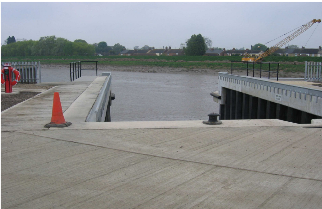
The new wet dock in the River Nene Travel hoist in the boatyard

The new wet dock is capable of lifting boats of up to 75 tonnes out of the water using a straddle carrier A concrete capping beam was added to the sheet piled wall for support It was very important that the excavation of the wet dock took place in the dry conditions between the high and low tides