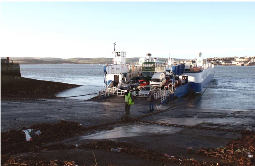
A Ferry and Slipway

A ferry has operated on this route since 1791, with the first chain ferries being introduced in 1832. Vessels have been replaced over the years, with the third ferry being added in 1930. Demand for the service has recently increased with the development of more residential areas in Torpoint.